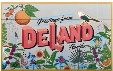
Greetings from DeLand Artist: Erica Group Kiel 100 block of south Woodand Blvd (east side)