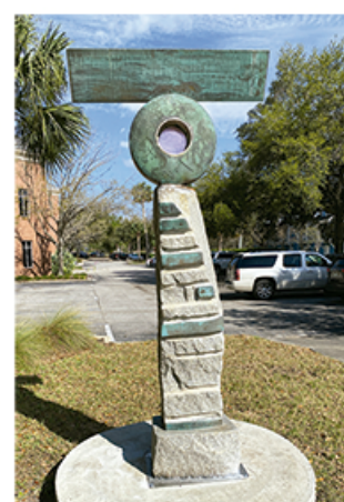
4. Origins Marker