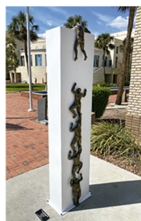
3. Small Beings helping each other