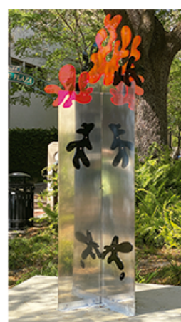
2. Next Dimension