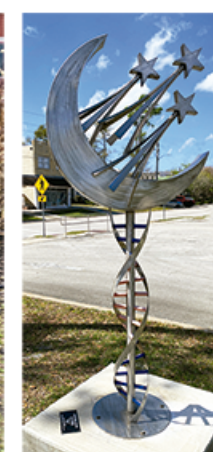
6. Shooting Stars