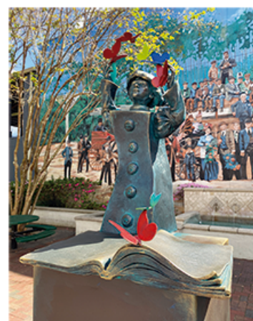
7. The Juggler of Illusions