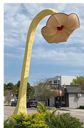
8. Iliana II