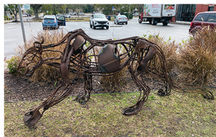
5. Florida Panther