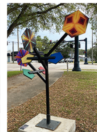
9. Tree Branches