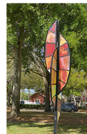
10. The Feather