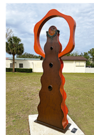
12. Foo Dog Column