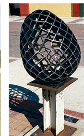
13. Fractured Egg